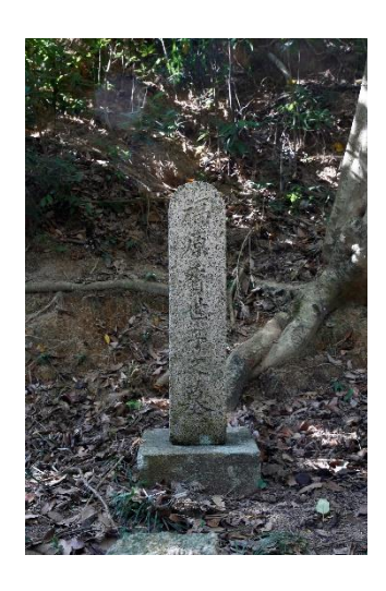
Kayo was just five months old when she passed away from convulsions.