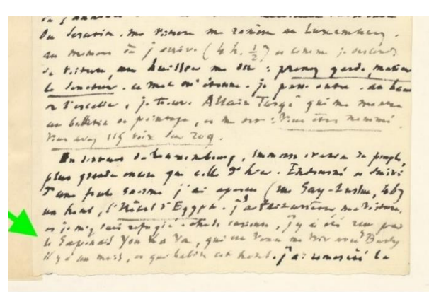
Source gallica.bnf.fr / Bibliothèque nationale de France. Département des Manuscrits, NAF 13480

The Meiji government launched a series of initiatives aimed at bridging the country's technological gap with the West and safeguarding its political autonomy. These included abolishing feudal domains, setting up a modern political system, and reforming its institutions. It hired over 2,000 foreign engineers and teachers and led several overseas missions to more technologically advanced countries, including Britain, the U.S, and France. Japanese students were sent overseas between 1871 and 1873 to various training academies. The Ministry of Education was established in 1871 and the education system reformed to develop human capital. Nine Imperial Universities were created in 1886, in addition to Keio University (founded in 1858) and Hitotsubashi University (founded in 1875). Both Keio and Hitotsubashi were instrumental in providing the necessary training in economics, accounting and management required for the country's new breed of entrepreneurs.