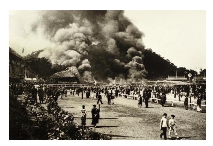
The Happy Valley Racecourse fire left over 600 people dead, including 22 members of the Japanese community.

On February 26, 1919, the Society unveiled a grand monument dedicated to all the victims of the fire, with a calligraphic inscription by Ōtani Kōzui. Initially situated next to the crematorium, it was moved to its present location in the Japanese section of the Hong Kong Cemetery in 1982. Another memorial to those who perished in the fire erected by the Tung Wah Hospital sits over the hill in So Kon Po, near the Hong Kong Stadium. Its original site was selected in an area known as the Coffee Garden and, with the benefit of public donations, construction on two pavilions, a memorial arch, and two pagodas started in 1922. The Race Course Fire Memorial was declared a monument on October 23, 2015, and is protected under the Antiquities and Monuments Ordinance.